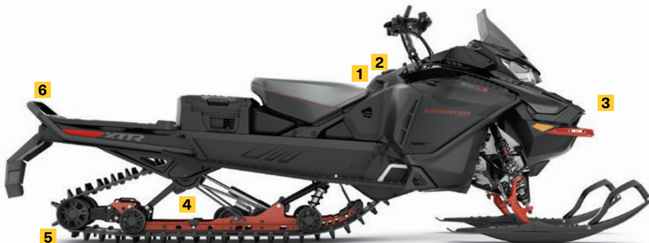
EXPEDITION XTREME 900 ACE TURBO R SHOWN

The REV Gen4 platform paired with the RAS X crossover front suspension allows effortless maneuvers in deep snow, while the 20 x 154 x 1.8 in. Cobra track provides incredible flotation and traction.